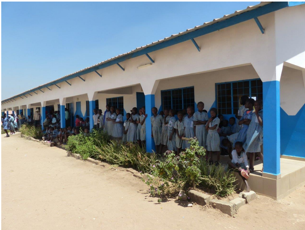
Tubakuta, region 2.