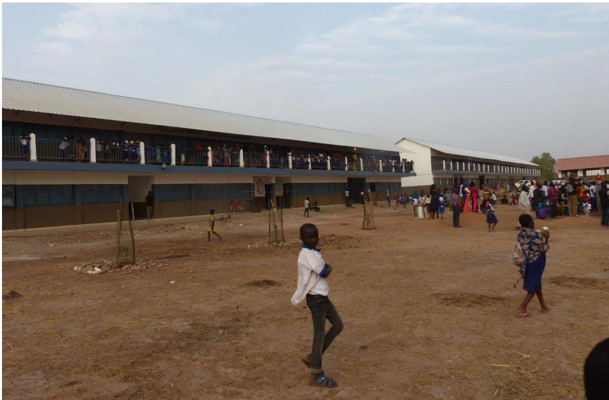
Bottom: Kulari, region 6. 24 classrooms.