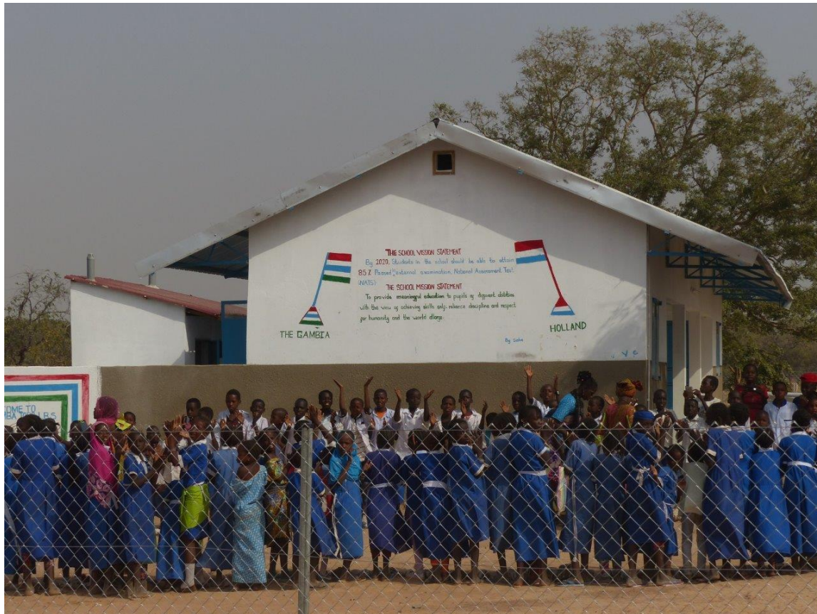
The village Changally has been renamed to Changally Holland