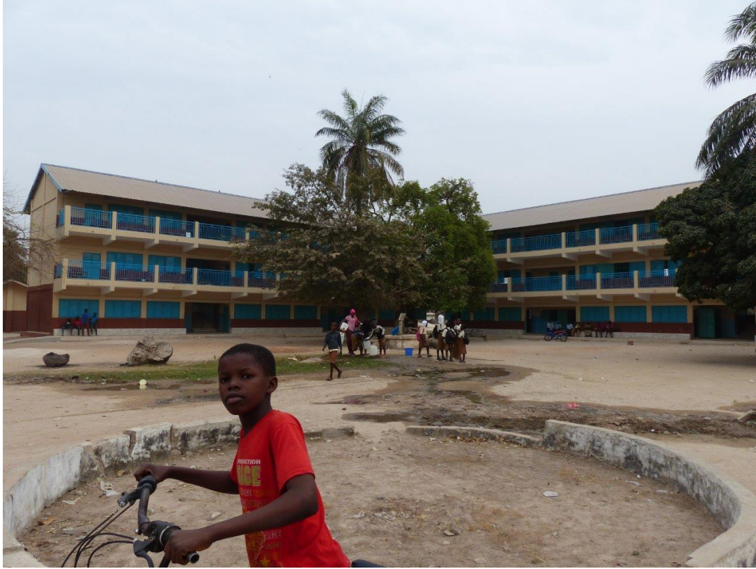
Above: Jamisa SSS (18 classrooms), below: Jamisa UBS, halfway (18 classrooms)