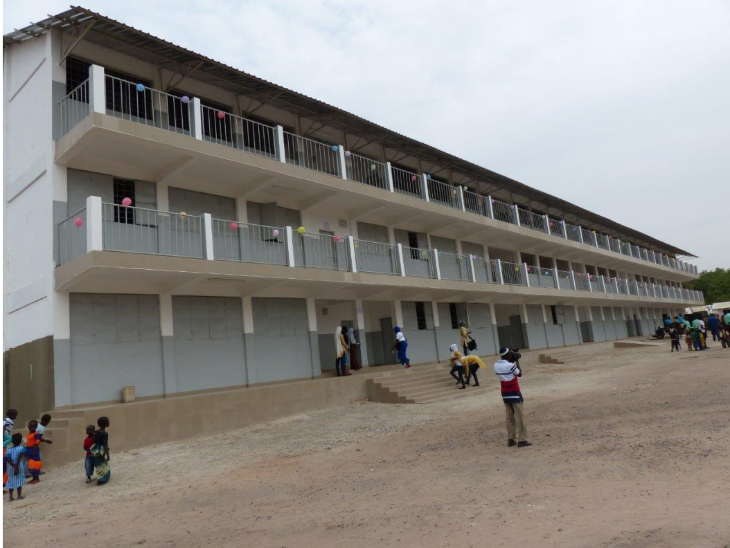
New 18 class room building in Medina Sering Mass (North bank)