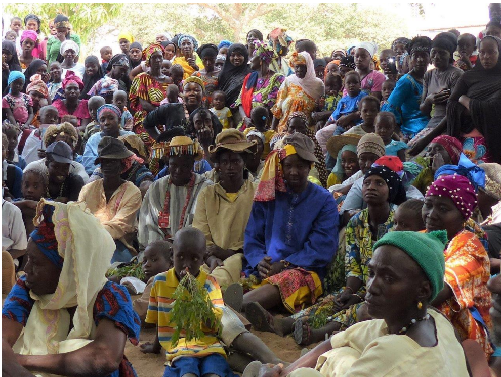
Each school opening is a big party: Misera Basic Cycle School, Upper River region.