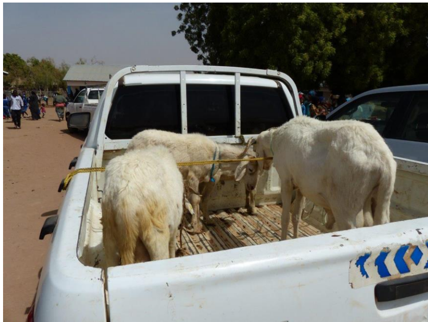
We received many gifts....