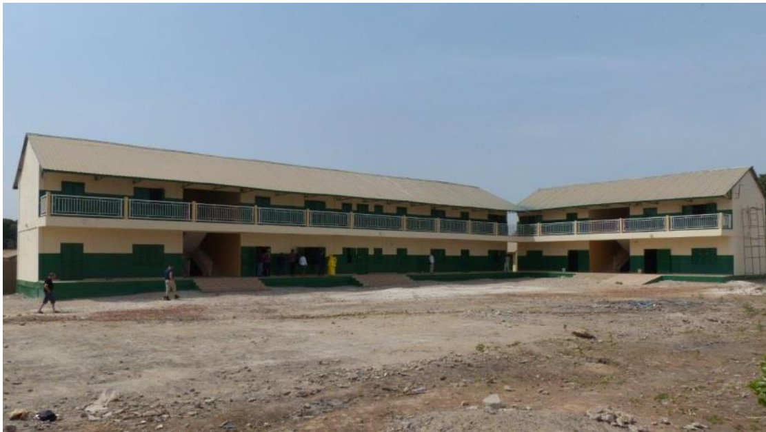
New school, Sinchu Alagi Lower Basic School, with 12 classrooms