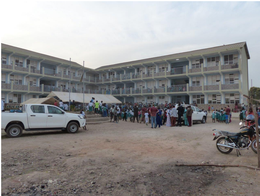
Two pictures of the first phase of Nema Kunku (18 class rooms)