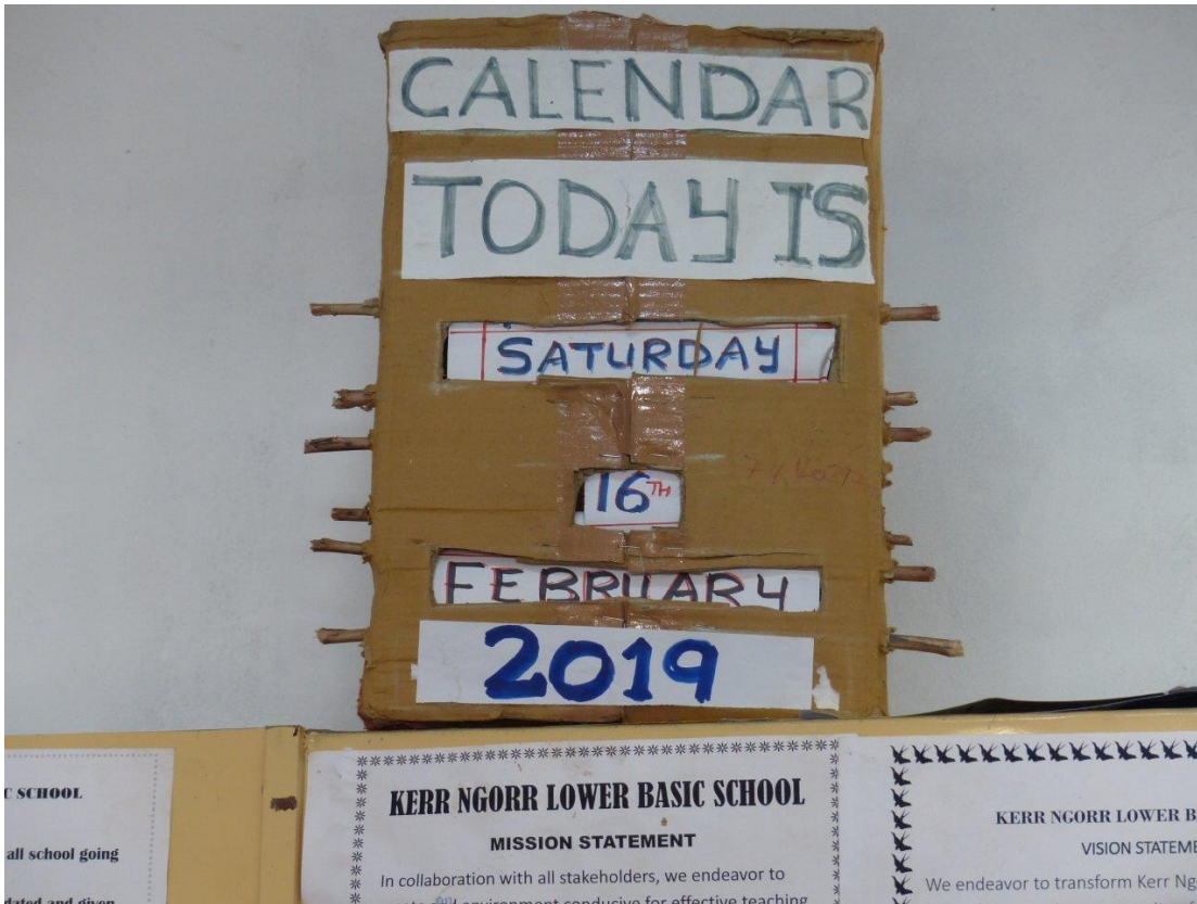
Below: Unique Calendar in Kerr Ngorr (North Bank).