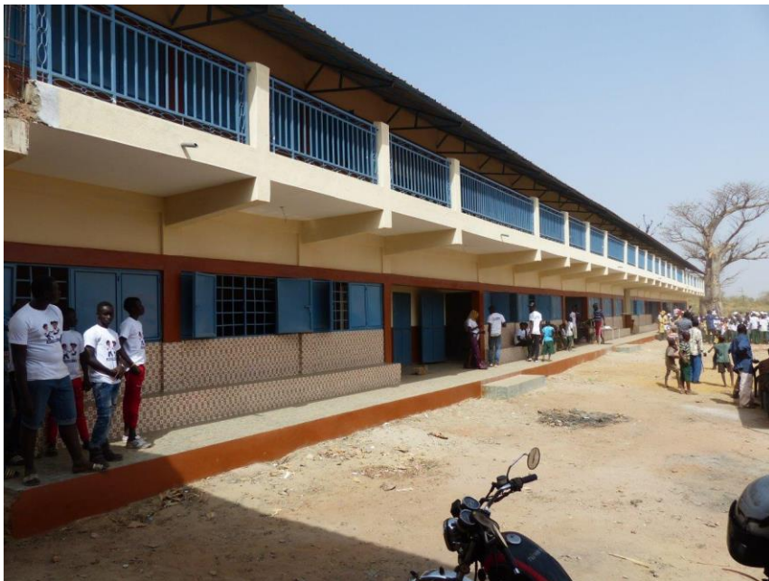
Welingara Ba Basic Cycle School – 24 classrooms