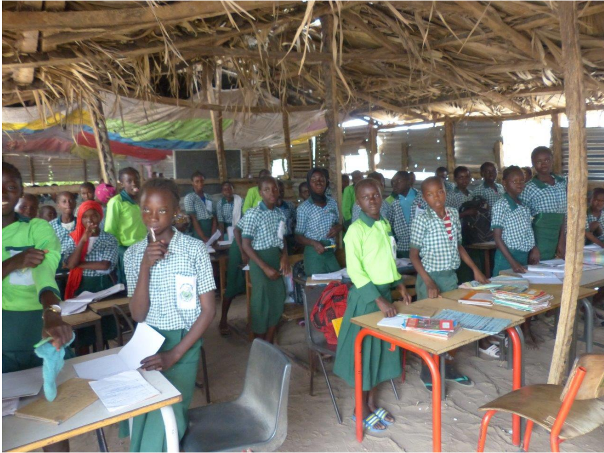
Top: A very bad school building at Sinchu Wuri.