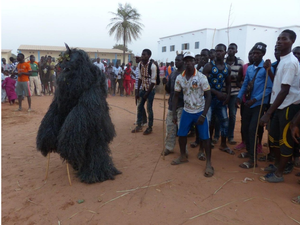
Each school opening is a big party. This one is in Kagnobon, Senegal.