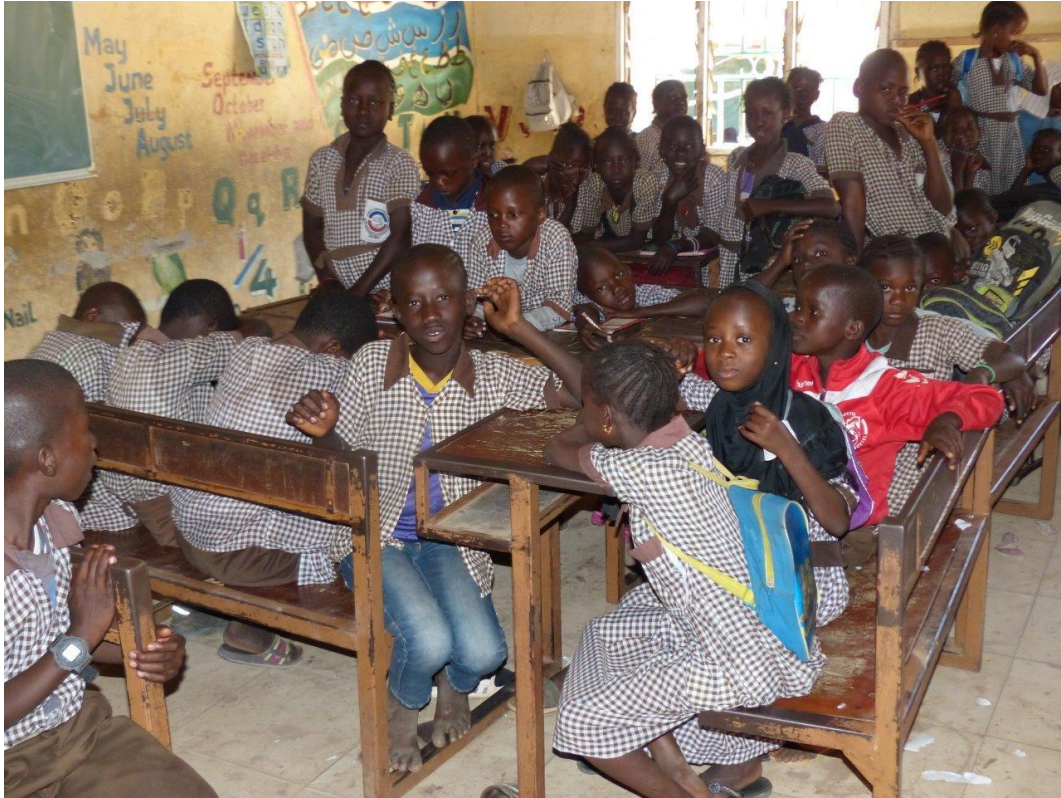
Yes, it is possible to have twice as many children on each piece of furniture.