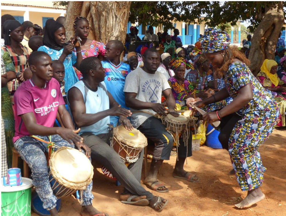
Each school opening is a big party. This one is in Kagnobon, Senegal.