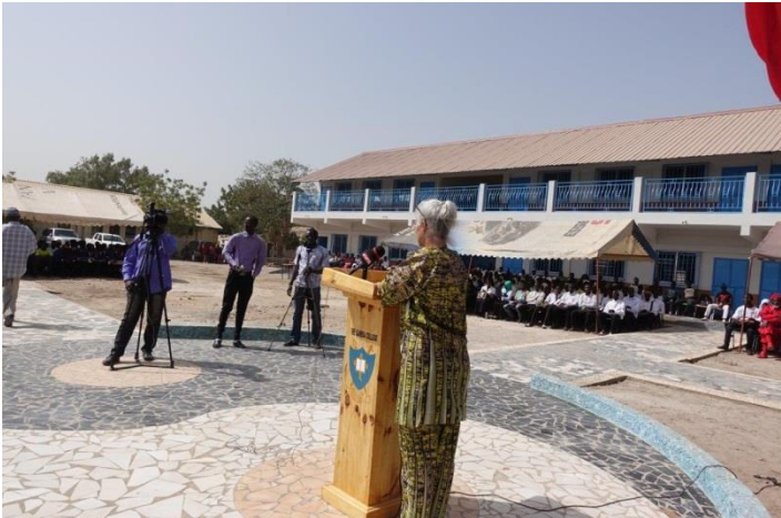
Opening 18 class rooms at Gambia college