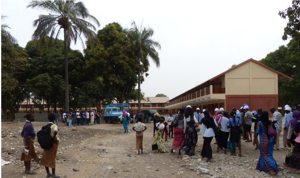
Top: Jamisa LBS (30 classrooms) ;