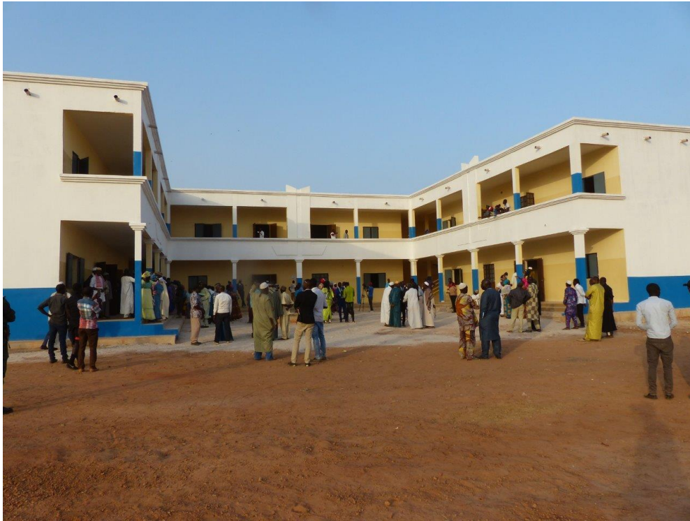
Kagnobon, Casamance, Senegal