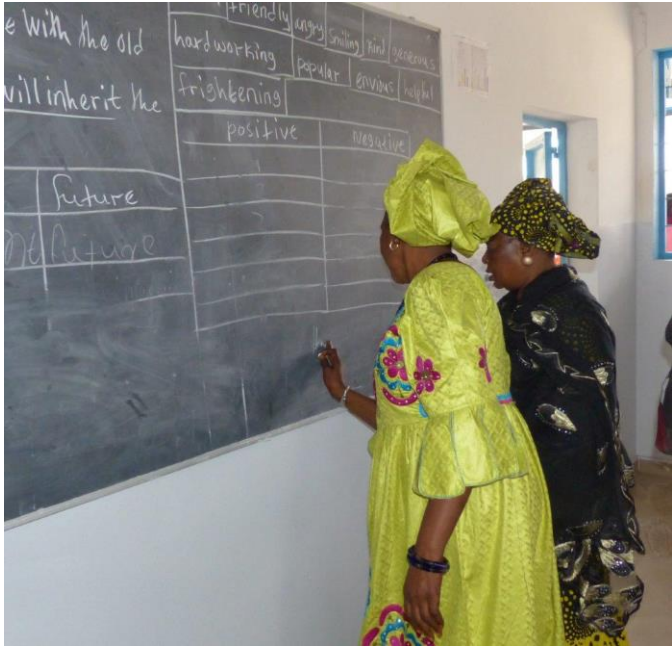
Below: The head mistresses of Sifoe LBS and Mandinary LBS testing new school boards