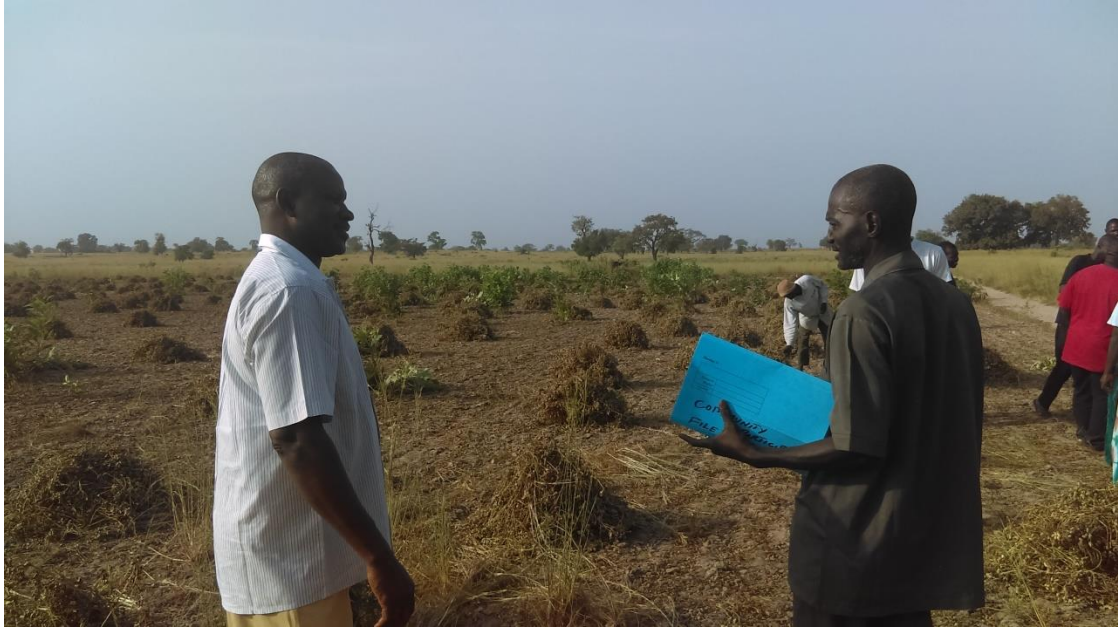
Jamagen Joka LBS-North Bank. above: 2017, below: February 2019