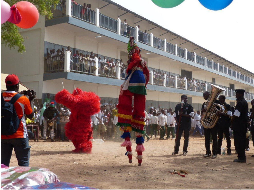
Top: Koba Kunda LBS, region 6; 36 classrooms