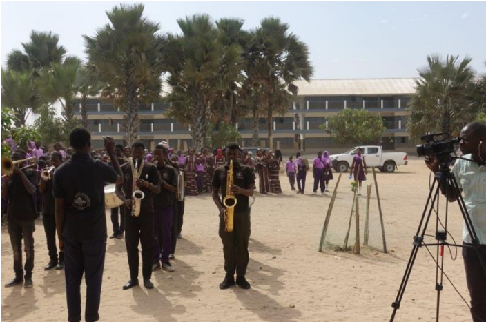
Opening 18 class rooms at Brusubi LBS