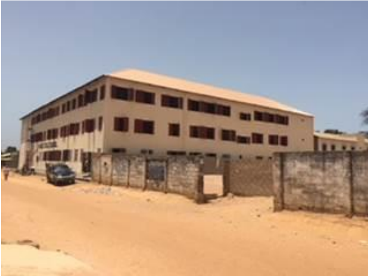
New building at Babylon school, Lamin