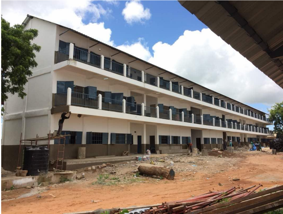
Above: the first of two blocks with 18 classrooms at Koba Kunda.