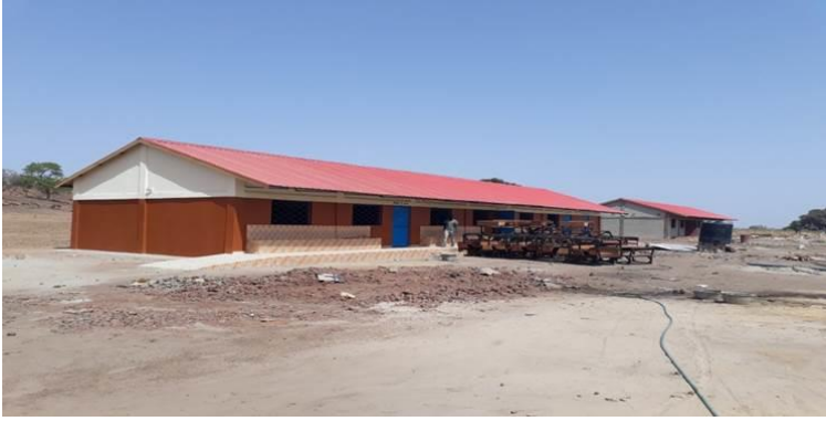
New building in Jassong