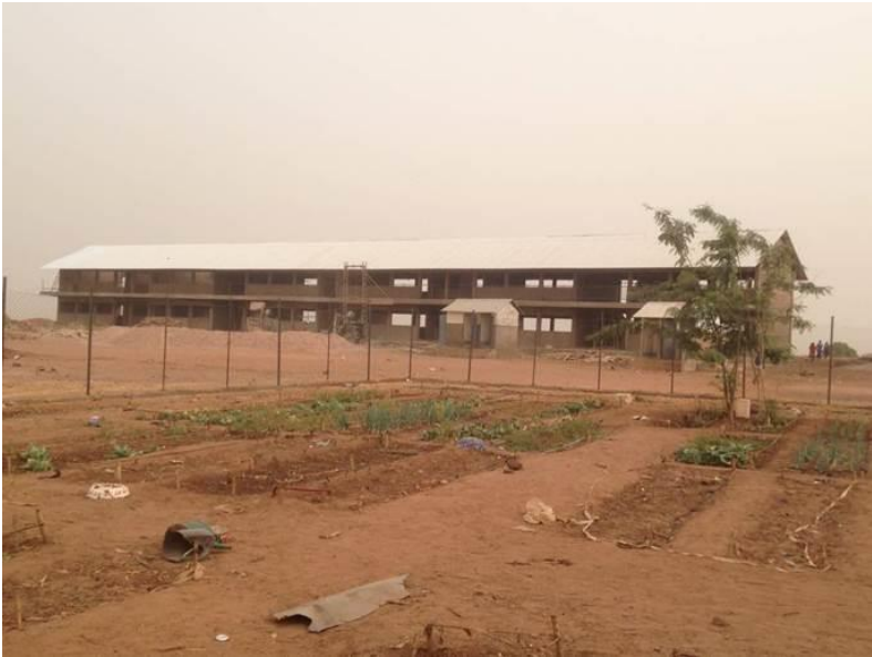
New building in Kulori