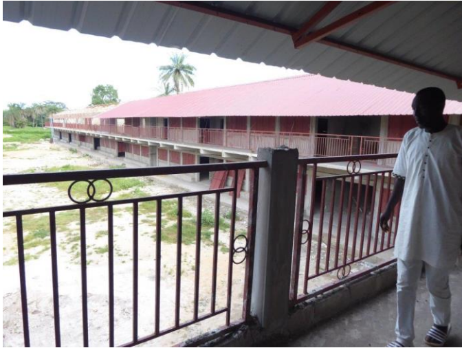
Left and above: New building at Jamisa Lower