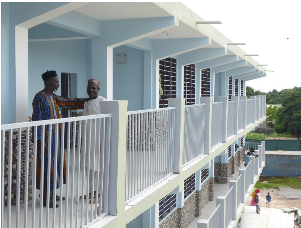
Below: The second block with 18 classrooms at Nema Kunku.