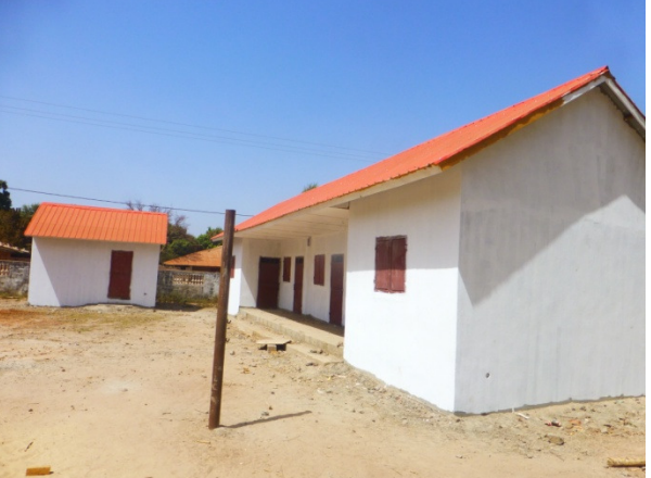
The new school (in preparation) and the new teacher quarters at Jambur.