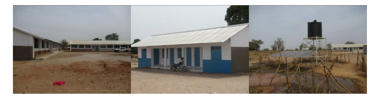
The new school building, teacher quarters and water supply at Bantanding Tukulor Lower Basic School.