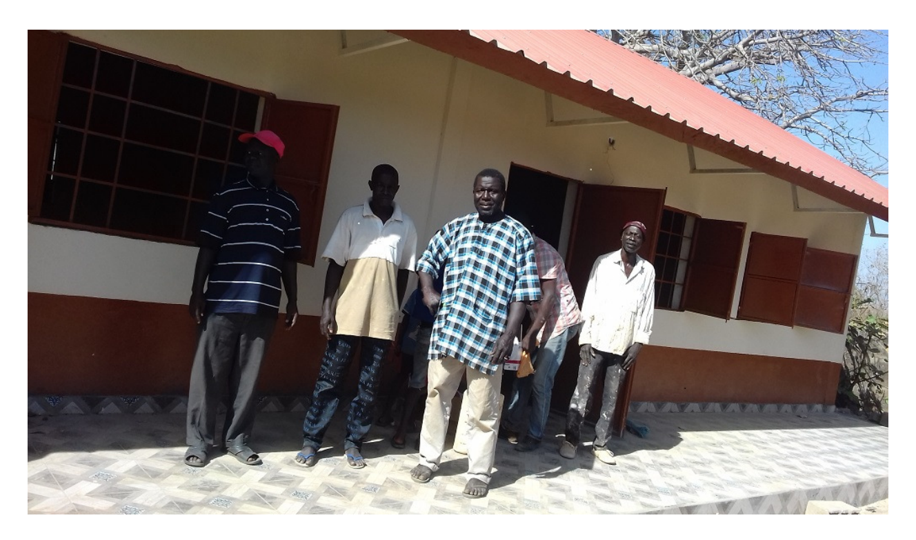
The new school in Kiang Manduar.