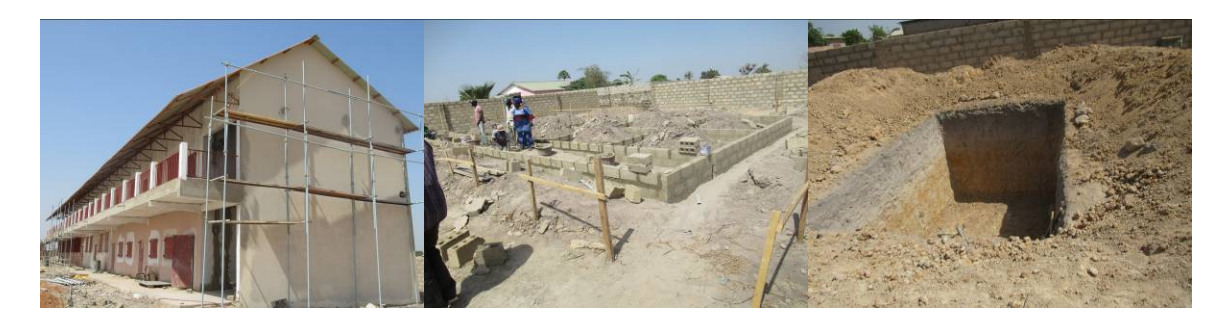
School building, teacher quarters and toilets under construction at Busumbala lower cycle school.