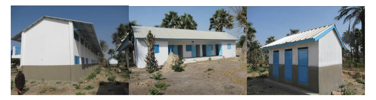
The new school, teacher quartets and toilets in Gunjur Kunkunding lower basic school