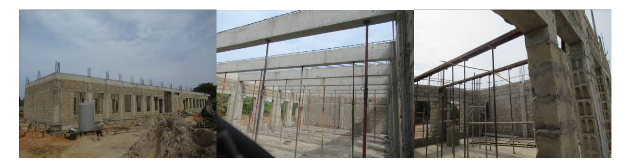
Construction of the Science University at St. Peters school. A project incollaboration with stichting "Kinderen van Lamin".