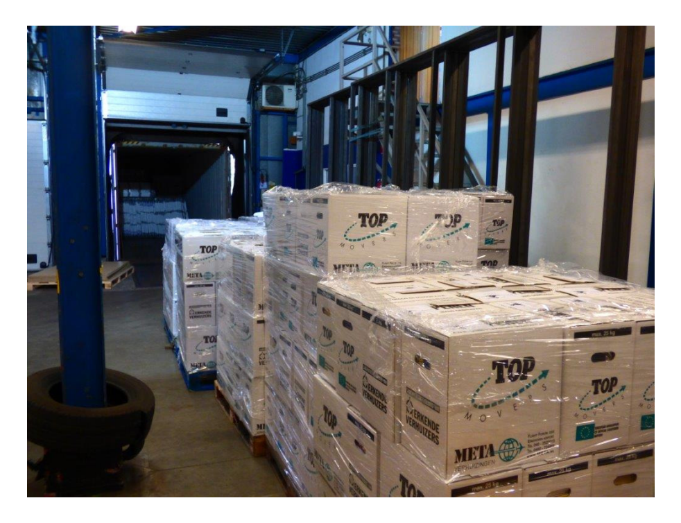
Shipment of 30.000 children books, provided by stichting Read to Grow, in two containers with 272 blackboards + 272 pin boards (supplied by Smit Visual).