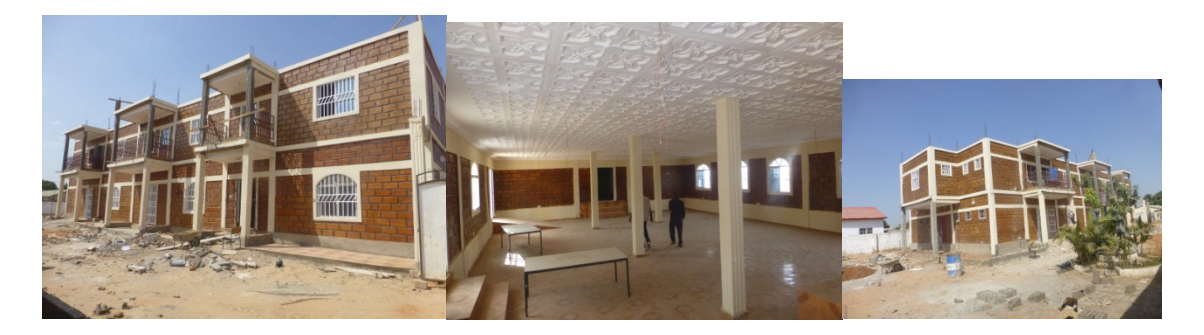
Construction at Insight Training Center is almost completed.