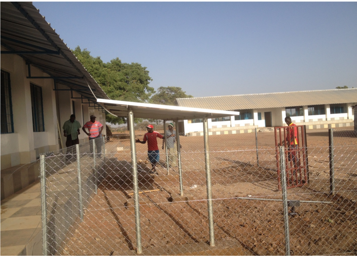
School and solar installation at Kerr Bohoum (North bank). COMPLETED OUTER AND IN-HOUSE COMPONENTS INSTALLATION INCLUDES 330A/H 24vOLTS BATTERY BANK, 1600WATTS INVERTER, VICTRON 50/100 MPPT CHARGE CONTROLLER, BATTERY BALANCER, SYSTEM MONITOR, MANUAL BREAKER AND 200A DC FUSE