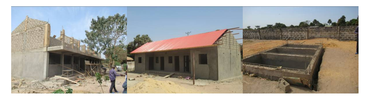
School building, teacher quarters and toilets under construction at Jambur basic cycle school.