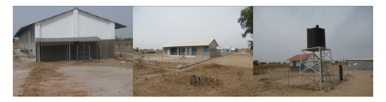
The new school building, teacher quarters and water supply at Jamagen Joka Lower Basic School.