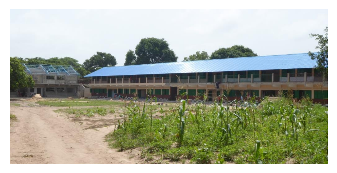
Below: The renovated building of Kabafita Upper Basic school.