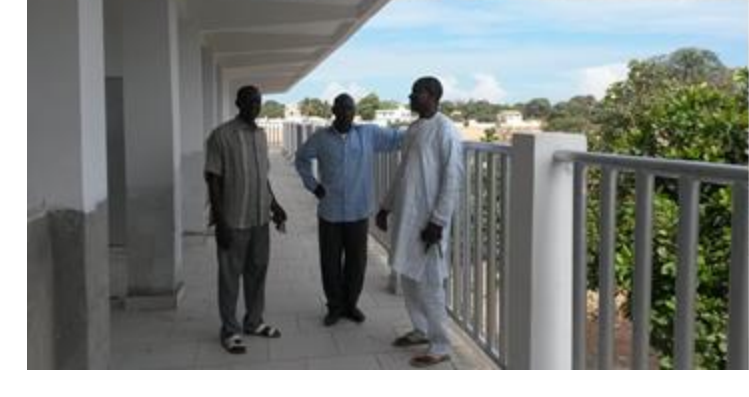
Bakoteh Upper Basic School

18 new classrooms And 21 classrooms renovated